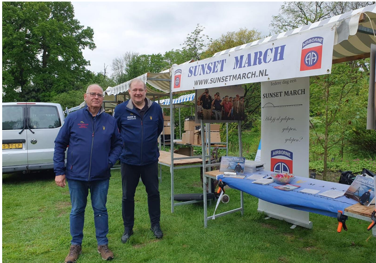
Photo 18: construction Infostand Vrijheidsplein Wageningen 5 May