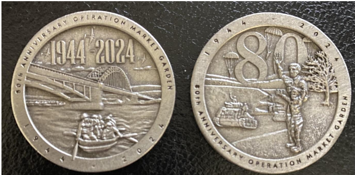
Photo 19: Commemorative coin 80 years of Market Garden