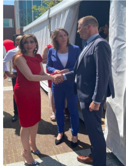
Photo 16: US Ambassador Ms. Shefali Duggal, Foreign Minister Ms. Hanke Bruins Slot