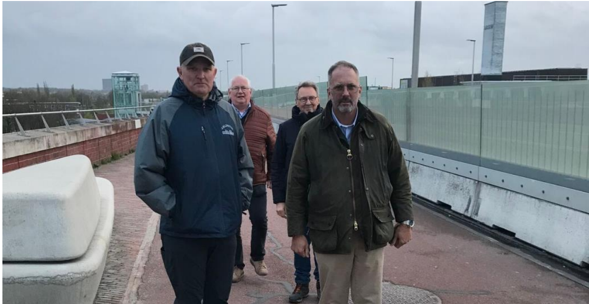
Photo 3: Members of the Four Chaplains Memorial Foundation

Another memorable Sunset March that took place last year was the March of the Four Chaplains Foundation in April. The Four Chaplains Foundation is an American initiative dedicated to individuals and organizations (mostly armed forces related) that selflessly dedicate themselves to others. We can firmly reveal that this visit will be followed up nicely in 2025.