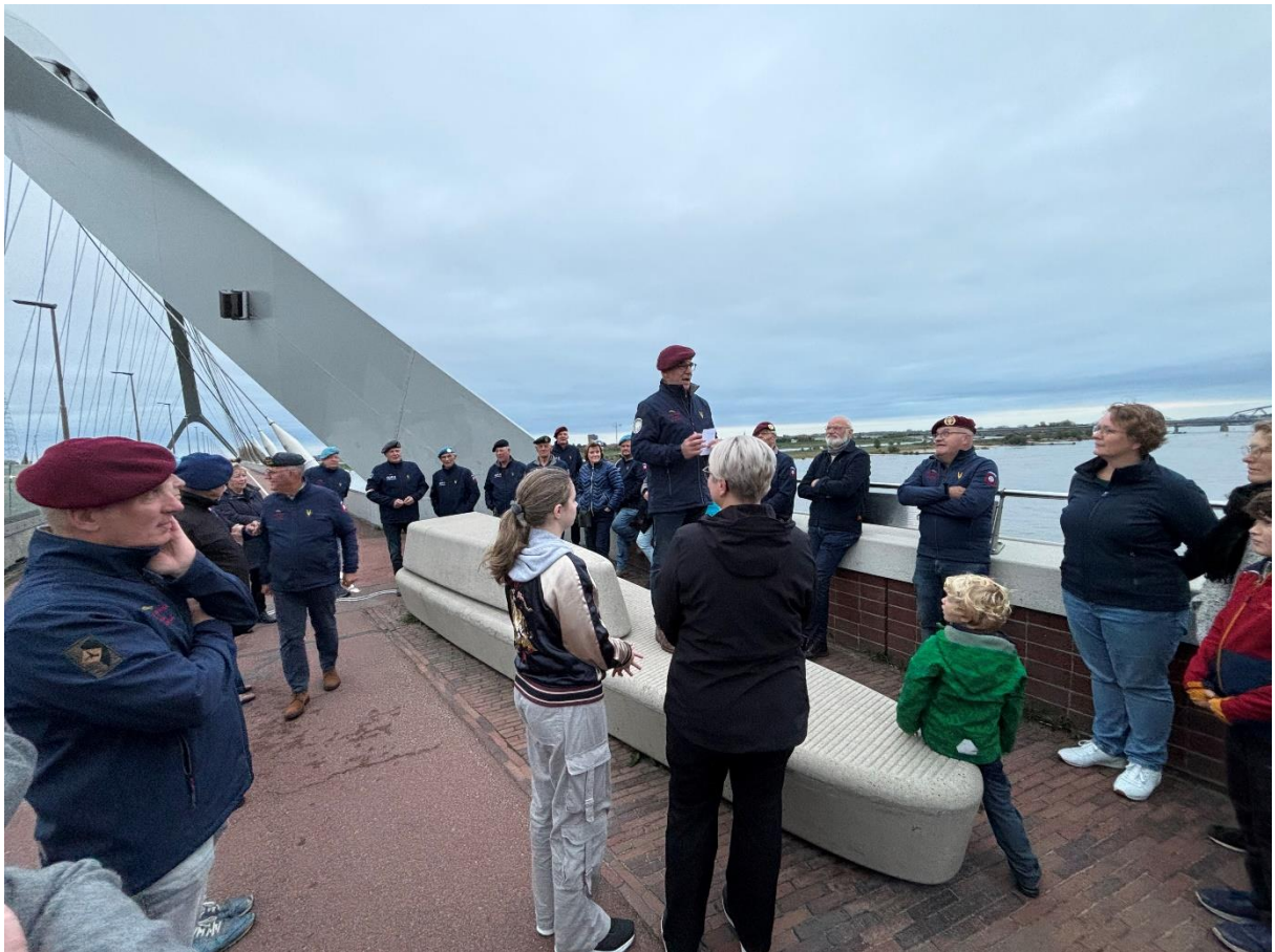
Photo 13: 19 October, 10 years of Sunset March