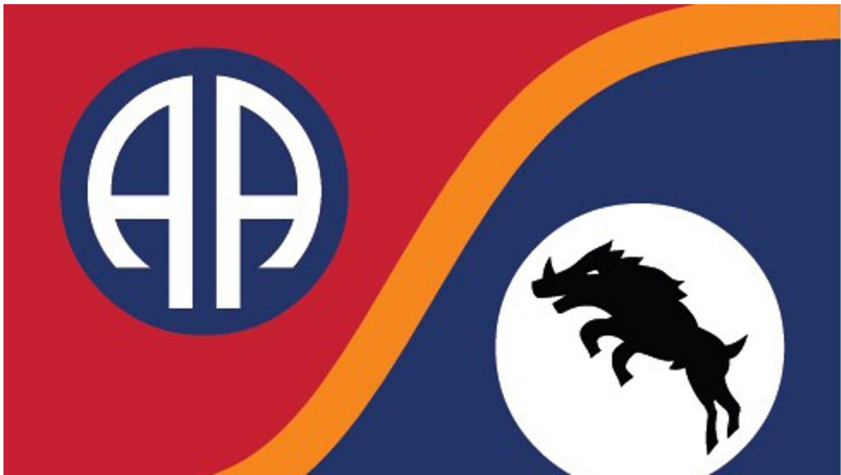
Photo 15: Regional flag Market Garden on the occasion of 80 years of liberation.