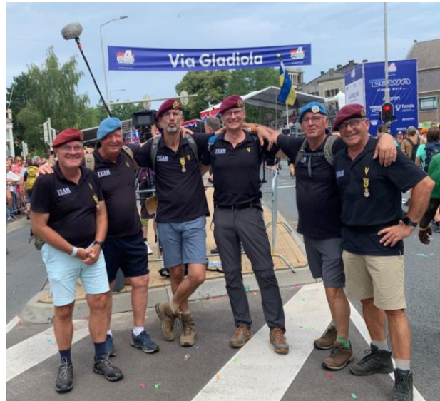
Photo 17: Six board members just before the four-day finish line.