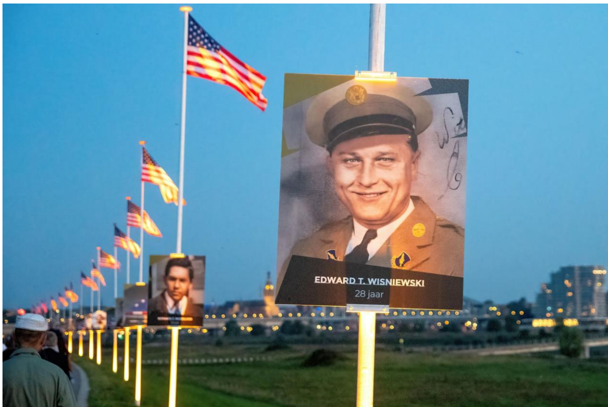
Photo 26: 21September Sunset March XXL, memory trail