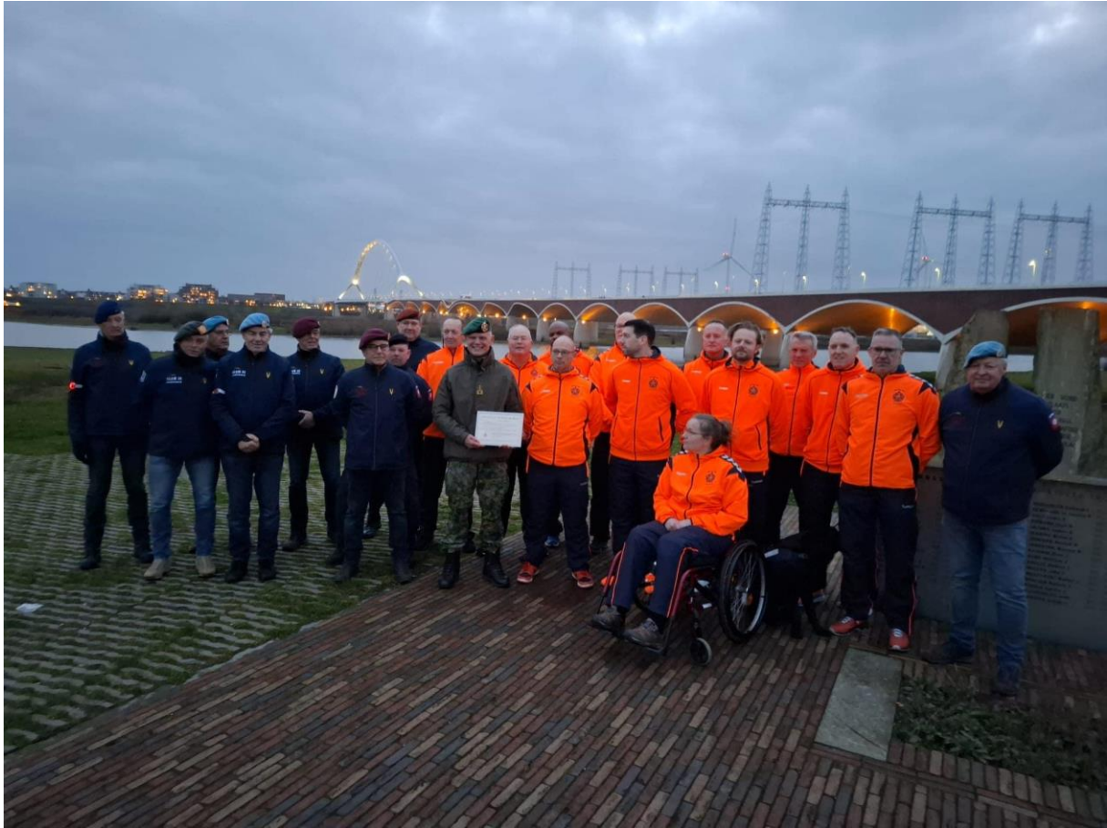
Photo 14: Commander of the Army, Lieutenant General Jan Swillens with members of the Dutch Invictus Team